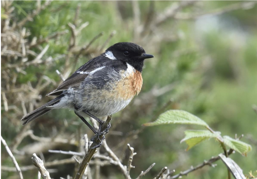
Stonechat - Increase in number of territories on the airbase. Whinchat have increased slightly on last year too.