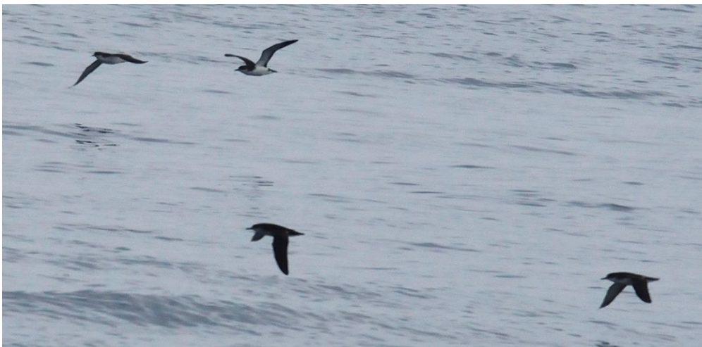
First of the Manx Shearwater - Later, saw around 200 further out heading South in small groups.