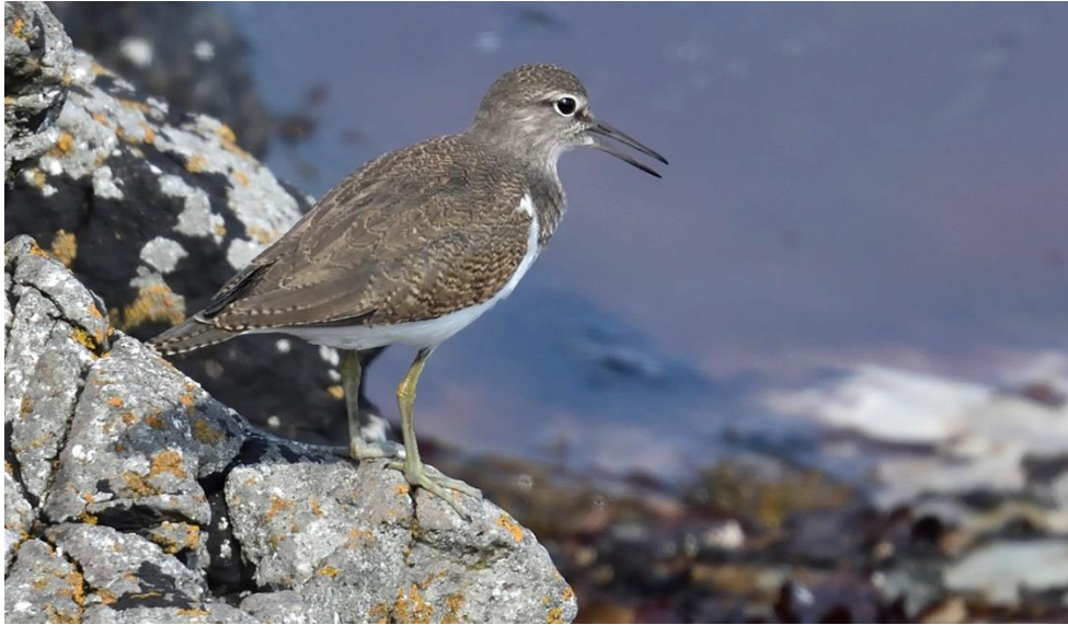
Common Sandpiper - Several seen at the Obs. 17 th , 25 th , 27 th July.