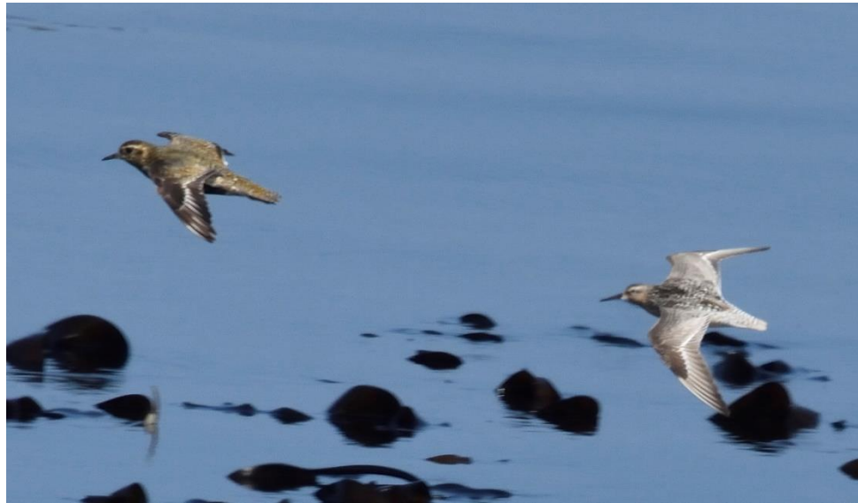
Golden Plover - 2 seen feeding with Knot. 25/07/2021