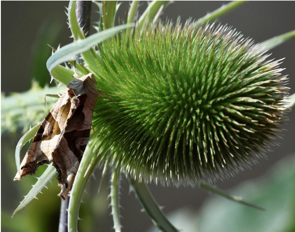
Angle Shades Moth seen on Teasle plant at the Obs garden. 17/07/2021