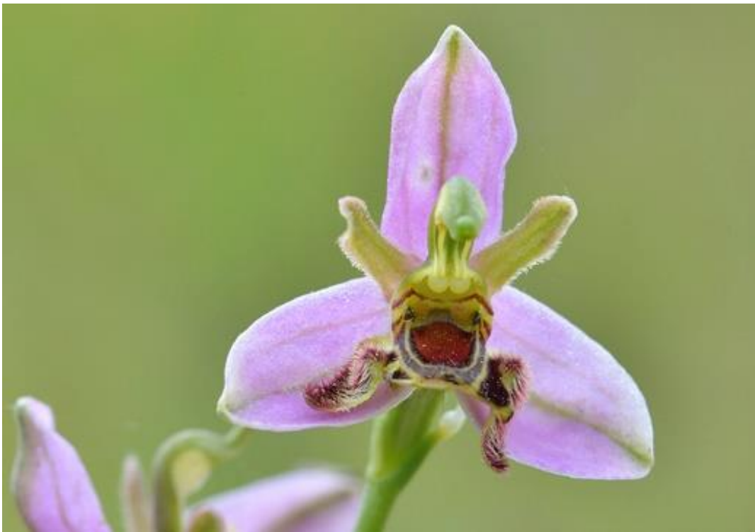
Bee Orchid - A rarity for Scotland. Recorded with the British and Irish Botanical Society.