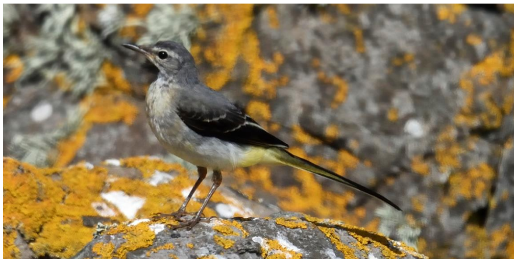
Juvenile Grey Wagtail - 25/07/2021