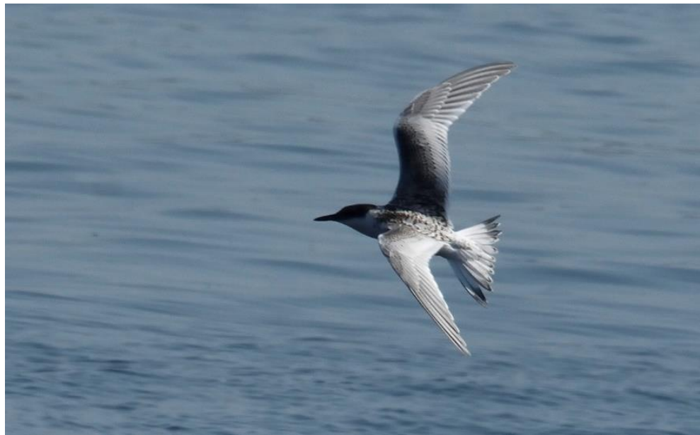
Sandwich Tern (juv) - Seen with 3 adults on rocks near Obs.