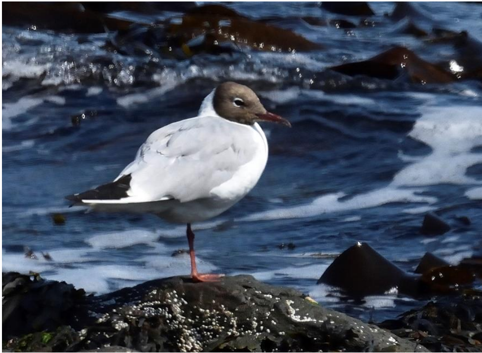
Black Headed Gull - Seen 17 th , 25 th and 27 th July. Small group of around 6 seen together. Obs.