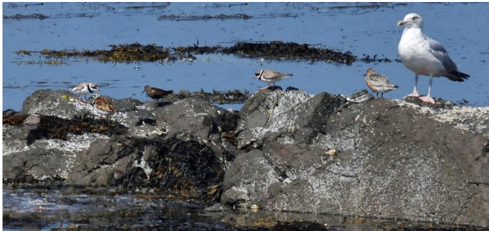
Several flocks feeding in front of the obs. A mix of Knot, Dunlin, Ringed Plover and a Turnstone. Heron and Redshank also present.