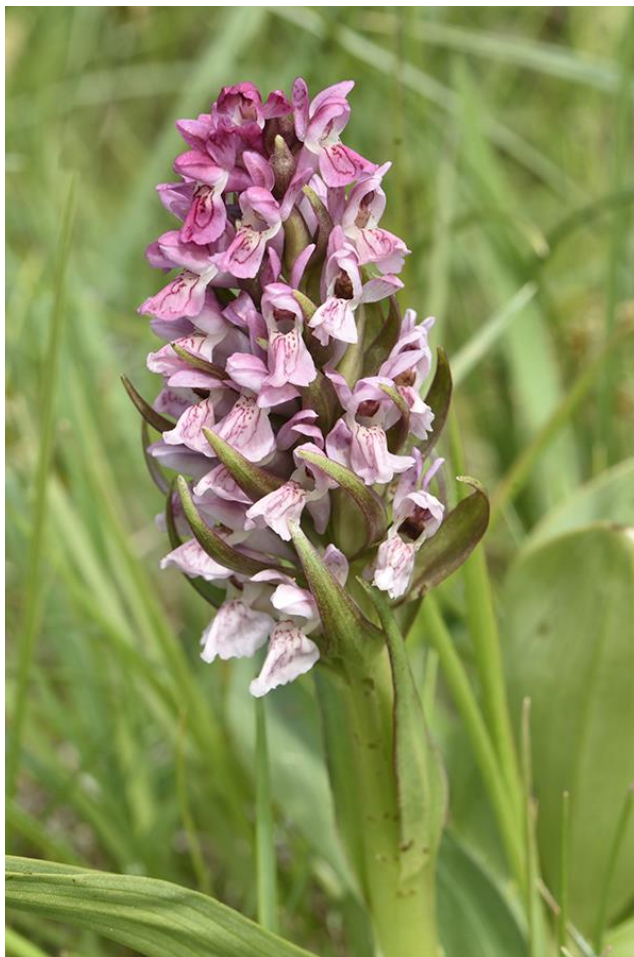
Early Marsh Orchid