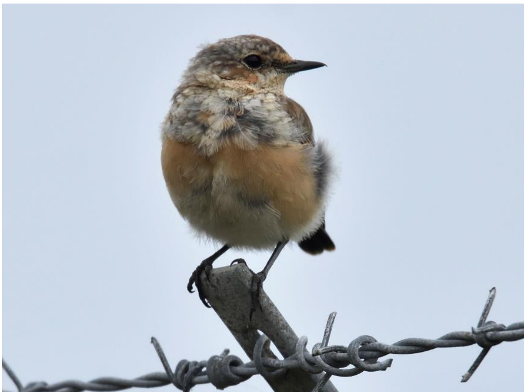
Juvenile Wheatear - 02/07/2021

For 2021 I notice that the numbers of certain birds are less than last year. The number of Sedge Warbler, Whitethroat and Redpoll are down. Linnet seem to have done well but I only heard and saw 1 Grasshopper Warbler this year and it was very late in the year at 03/07/2021. Cuckoo was only heard at a distance and only for a few days this year. Skylark were doing well until the fields were mown for silage.