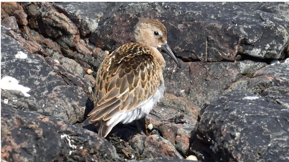
Dunlin - Several seen in with flocks.